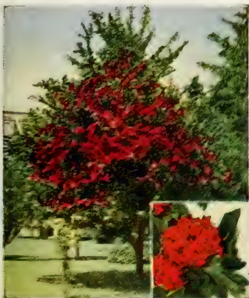
PAUL'S SCARLET HAWTHORNE